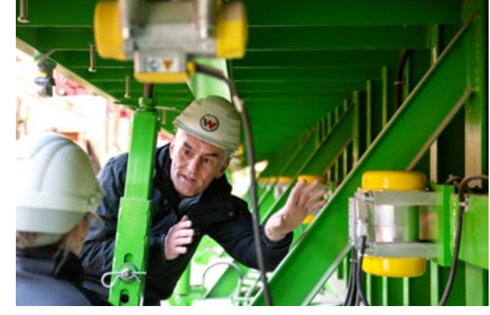
Our concrete specialists will gladly advise you in finding the perfect solution for your project. They will help you with the correct selection and dimensioning of the vibrator, with questions regarding power supply and control technology through to the installation and commissioning. In this way, you achieve the optimal result for your application area.