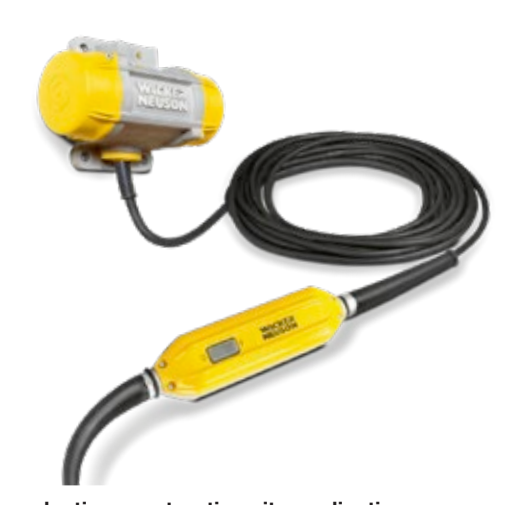
Perfect for selective construction site application: The ARFU26 is fitted with an integrated converter.