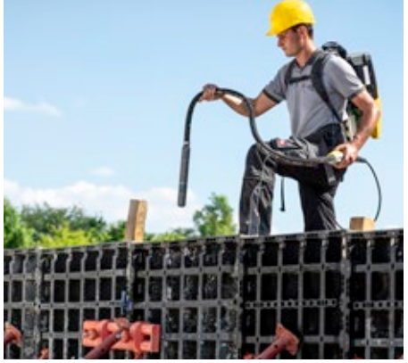
More safety on the construction site:

easy to change and can be used for a variety of construction equipment.