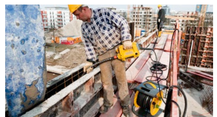
High level of operating comfort: the drive unit generates a high performance with low weight.