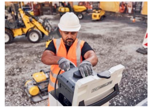
Loading and transporting with a system:

the battery and battery charger are safely stowed in practical Systainer boxes.