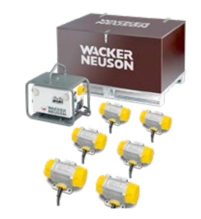
The practical aid: the exposed concrete kit. With the exposed concrete kit, you are perfectly equipped for the compaction of high-quality exposed concrete surfaces. The sturdy wooden box on a steel plate contains a frequency converter, external vibrators and fastening clamps.