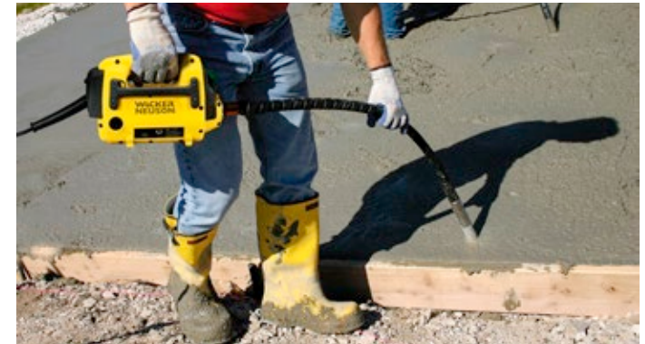
Economical solution: with a modular system for optimally compacted concrete with the Basic line HMS.