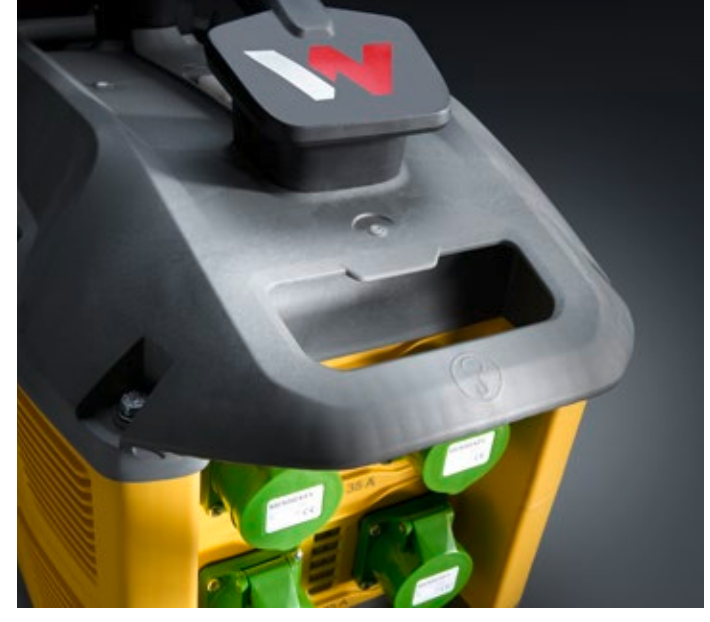
Integrated handles to the front and rear, as well as a central lifting eye make is easy to transport.