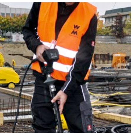
Practical guide handle for easy compaction of flat components.