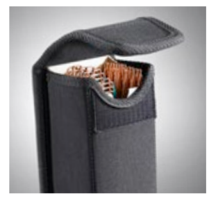
A practical holster is available for the rebar tier DF16, which can easily be attached to the waistband.