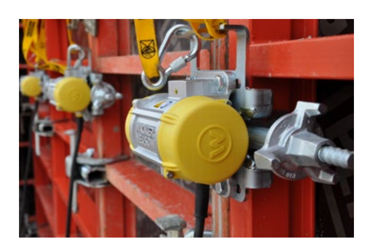
Flexible for in-situ concrete applications. There is a large selection of fastening clamps available from Wacker Neuson for the AR26. These can be attached to all common formwork.

Development and production Made in Germany