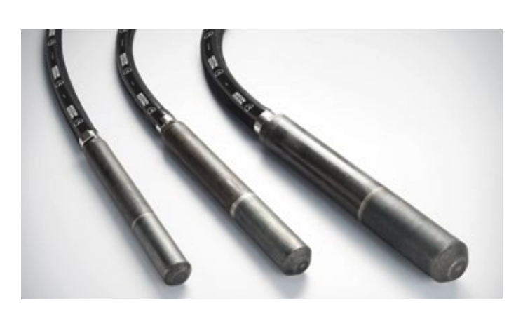
Durable and low-wear vibrator heads, additionally tempered in the bottom