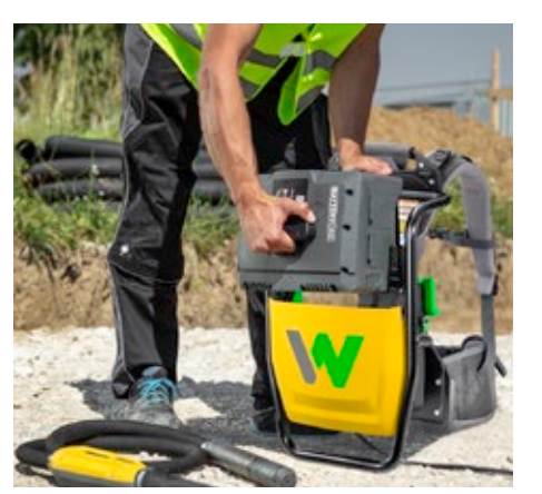
One for all

Battery One is a manufacturer-independent battery system with batteries that can also be used in the battery converter backpack ACBe.