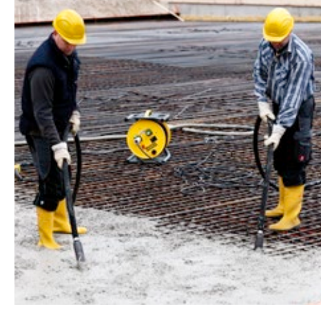
Dependable and sturdy: internal vibrators by Wacker Neuson are indispensable on many construction sites.